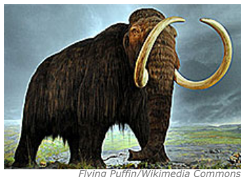
The woolly mammoth went extinct in its main range about 10,000 years ago.

would be pathetic. Nature, in other words, is widely seen as either hopelessly fragile or already completely broken.